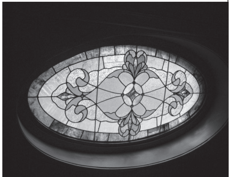
Stained Glass Window in Anderson Memorial Library

Attendees at the reunion were privileged to be able to visit the dome in the Anderson Memorial Library and search for their names that they had written upon the occasion of their graduation. Unfortunately, not all names remain, as some were painted over by the Way College. Alumni can search for their names virtually, thanks to a significant project done by the Emporia State University Archives. Most of the remaining names have been photographed and the signatures can be found at www.emporia.edu/libsv/archives/the-people-of-the-dome .