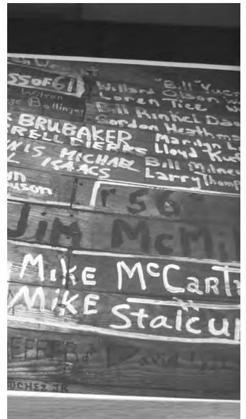
Many reunion attendees climbed to the Anderson Library dome to search for their names and the names of friends and classmates.