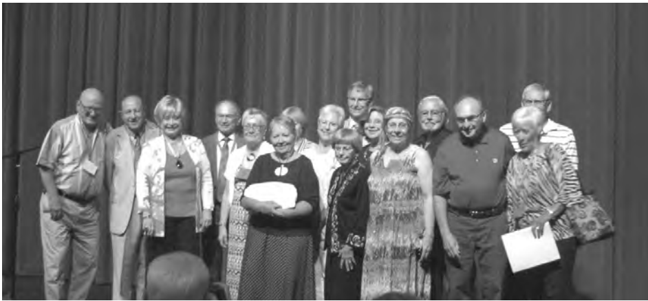
The Class of 1965 won "The Rock" for most attendees.